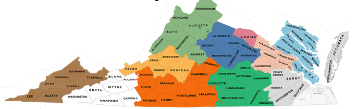
and the North Carolina counties of Currituck, Gates and Pasquotank